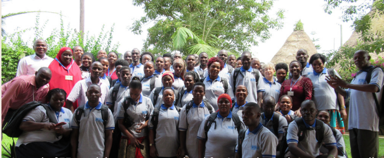
A total of 35 participants were trained for 2 weeks and are ready to roll out the study in Rakai district.

Through analysis of the Rakai Community Cohort Study (RCCS) data, we discovered that persons who come into study communities as immigrants have poor access to important health care and prevention services. Particularly, HIV+ in-migrants(defined as persons migrating into the community within the past 36 months) had poor access to Antiretroviral therapy services and while HIV- men had poor access to medically performed male circumcision among other HIV care access challenges. In effect, within their first 36 months of stay in the community, HIV- 'in-migrants' have disproportionately higher risk of acquiring HIV than the old residents. RHSP introduces the WIN study whose goal shall be a community randomized controlled trial that will test the efficacy of a rapid outreach intervention to new in-migrants; and to operationalize rapid linkage to HIV treatment and prevention services thereby contributing to HIV epidemic control. We are testing to see if among in-migrants in intervention arm communities, HIV incidence will decline to ~0.85/100 py vs ~1.55/100 py among in-migrants in the control arm; among HIV+ in-migrants. VL suppression will increase to ~75% vs ~37% in the intervention arm compared to the control arm.